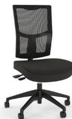
Urban Mesh Nylon Base