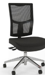
Urban Mesh Alloy Base