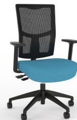
Urban Mesh Optional Arms